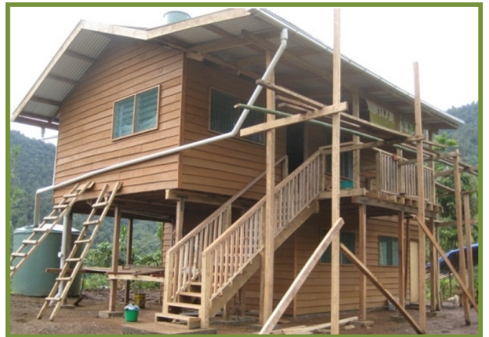
Our newly-completed village house and office

A lot of work had been going on for months and even years to prepare for our house building, but this latest and final chapter - the actual building of the house - began on August 31st as our family and a small crew of construction workers from Ukarumpa flew out to